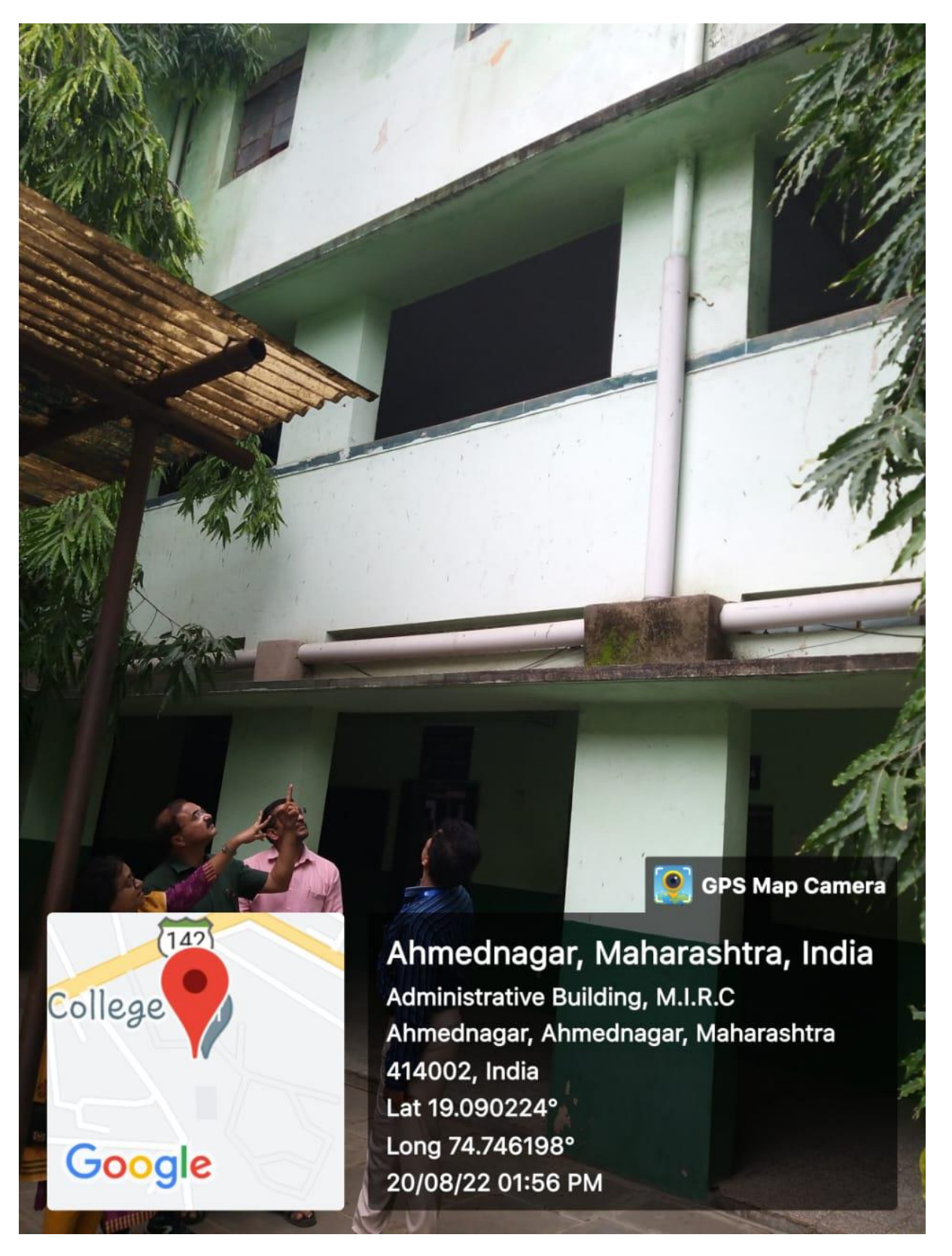
ROOF-TOP RAINWATER COLLECTION SYSTEM OF THE MAIN BUILDING OF THE COLLEGE