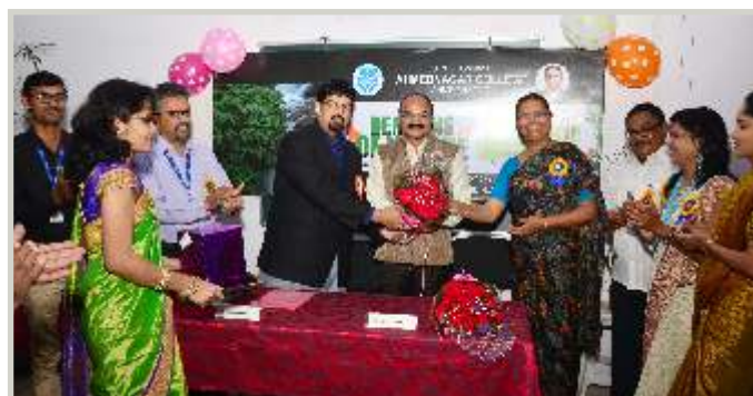
organized by the Post Graduate Department of Botany on 8th Feb. 2017. Students of different Colleges of Ahmednagar City participated in the competition.