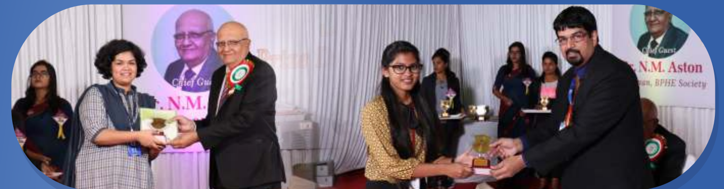
Rhapsody Prize Distribution Ceremony