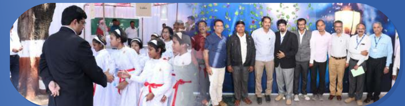
Christmas Celebration 2017