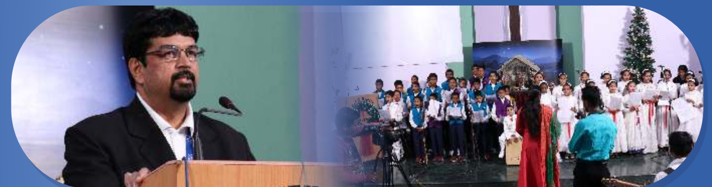
Christmas Celebration 2017