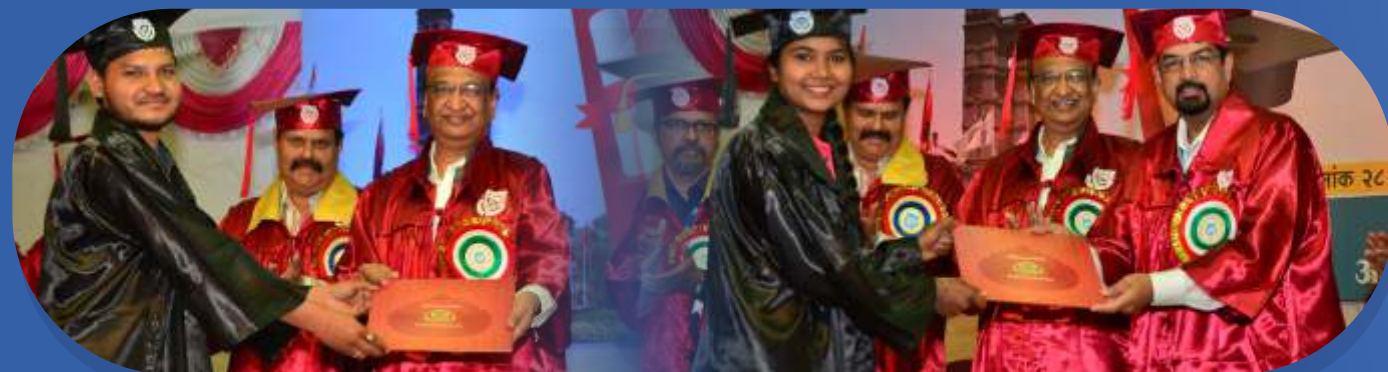
Convocation Ceremony 2018