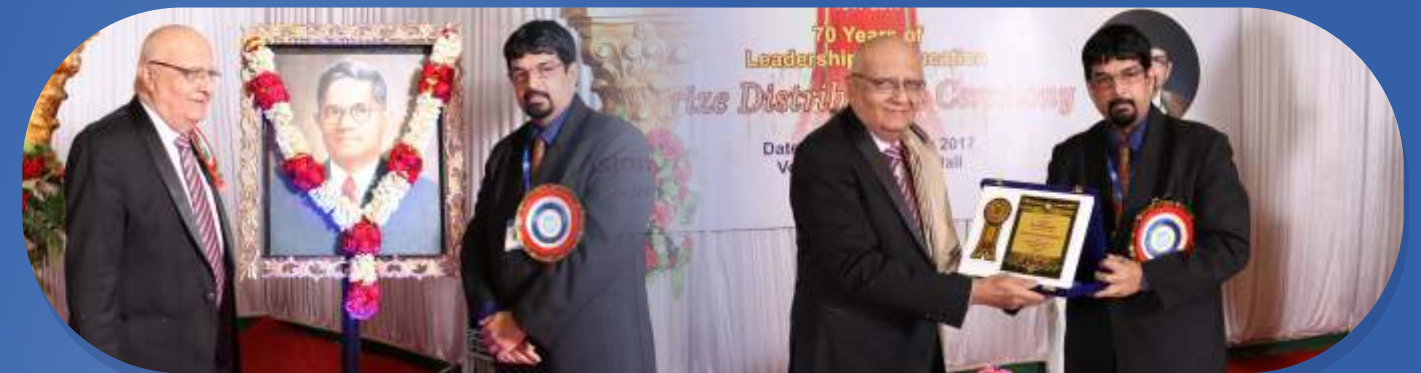
Rhapsody Prize Distribution Ceremony