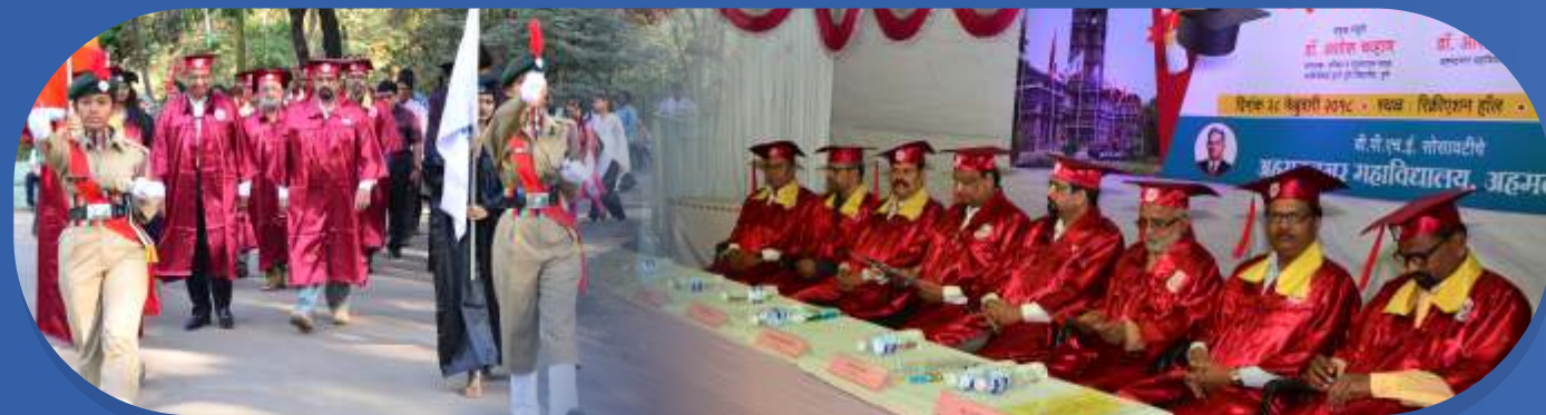
Convocation Ceremony 2018